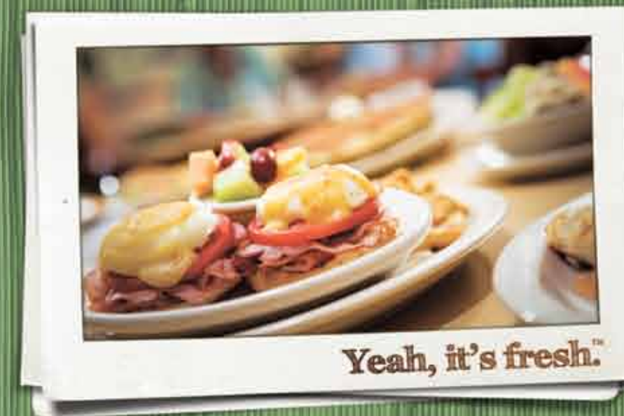
Yeah, it's fresh.™

© 2010 First Watch Restaurants, Inc. AZ1110